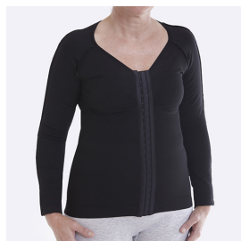
Fully openable front