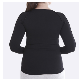
Shapes to the body